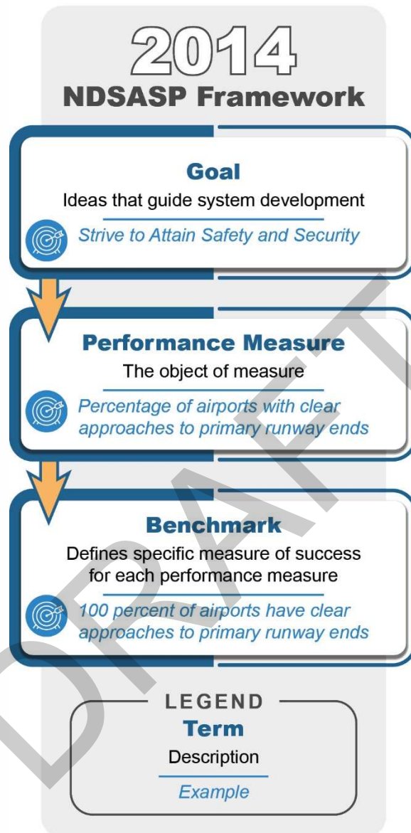
Figure 2-1. 2014 NDSASP Framework